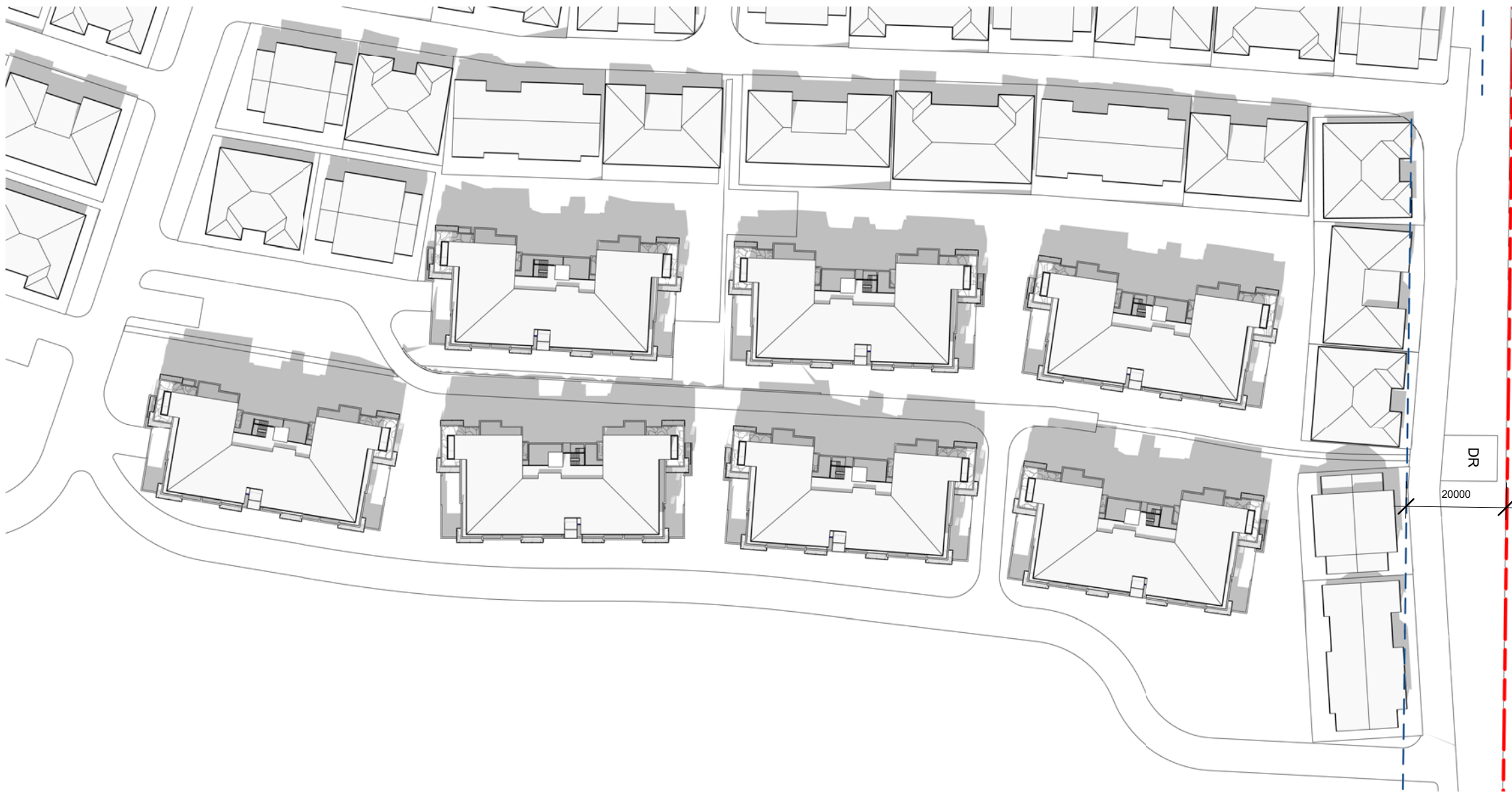
2 SHADOWS - APARTMENTS - 21 JUNE 12PM 1 : 1000