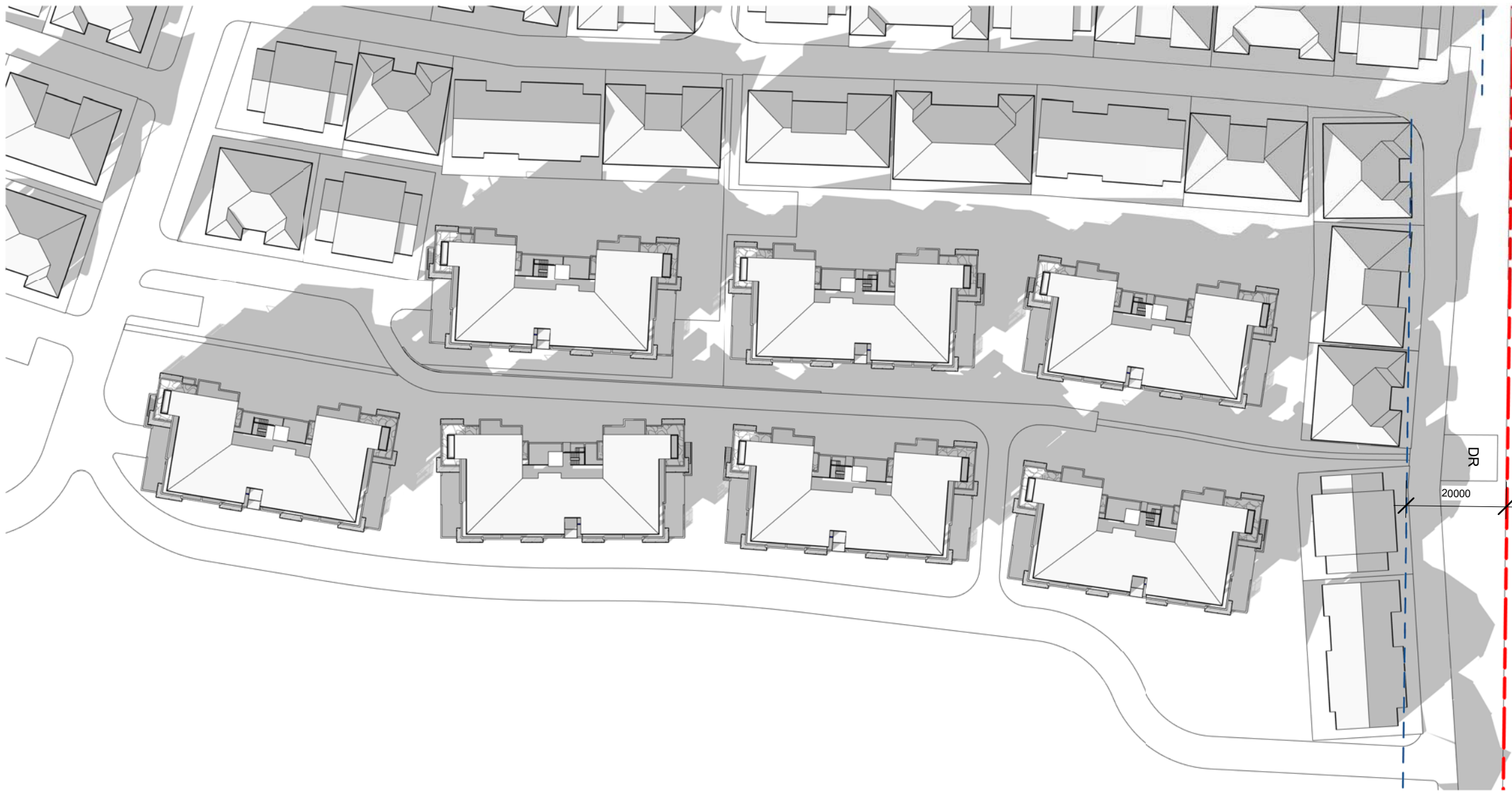
1 SHADOWS - APARTMENTS - 21 JUNE 9AM 1 : 1000