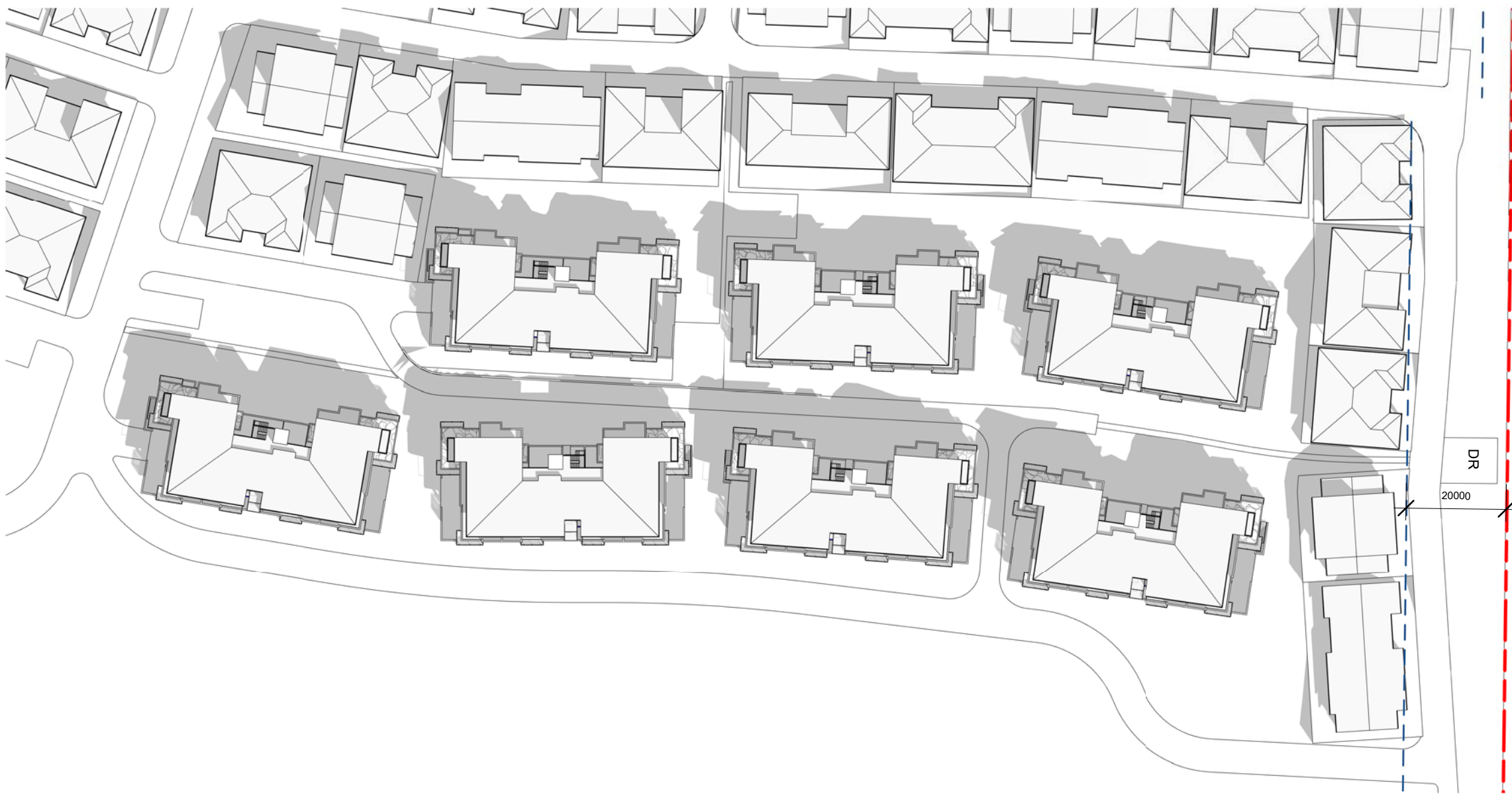
3 SHADOWS - APARTMENTS - 21 JUNE 3PM 1 : 1000